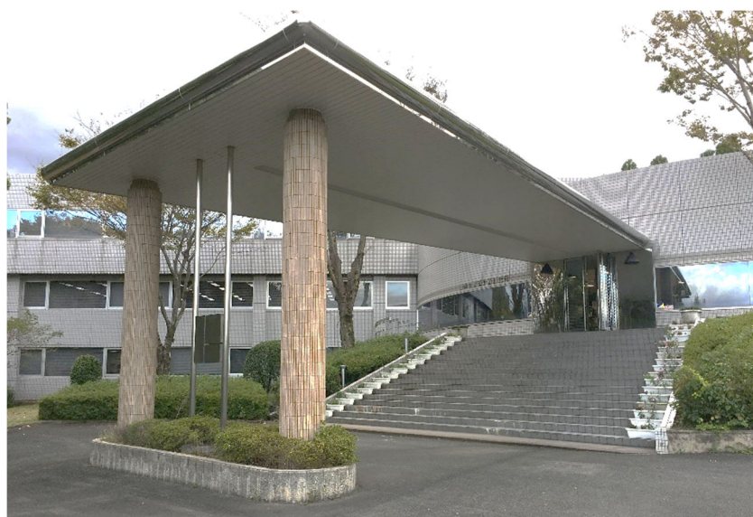
Building entrance where AOCTEL is located

After the integration and commencement of ONE’s operation, Kumamoto Stowage Planning Office took on the initiative role among ONE’s global stowage planning offices to strengthen efficiency improvement. To further advance stowage performance, enhance global teamwork and perform beyond best practice, ONE Japan, the subsidiary company of ONE in Japan, and KKE established AOCTEL, as the new partnership with the aim of working collaboratively with an innovative approach in providing best in class quality and service to ONE’s valued customers.