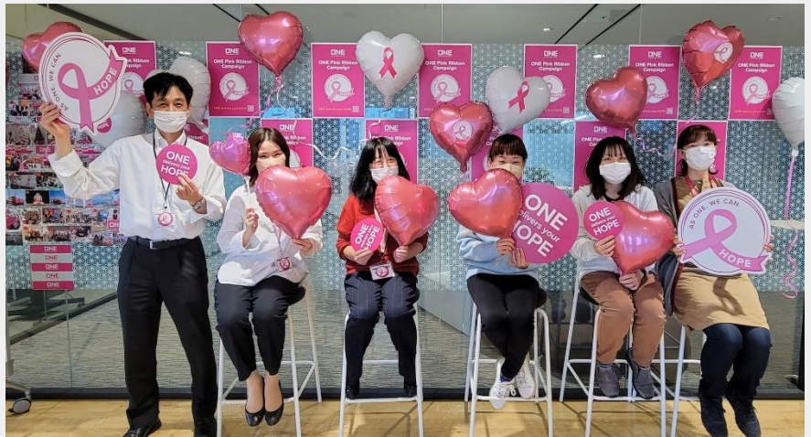
Staff taking photos at the Deco Wall